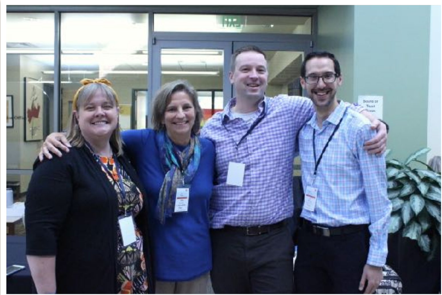
College Autism Summit, Nashville, 2023.