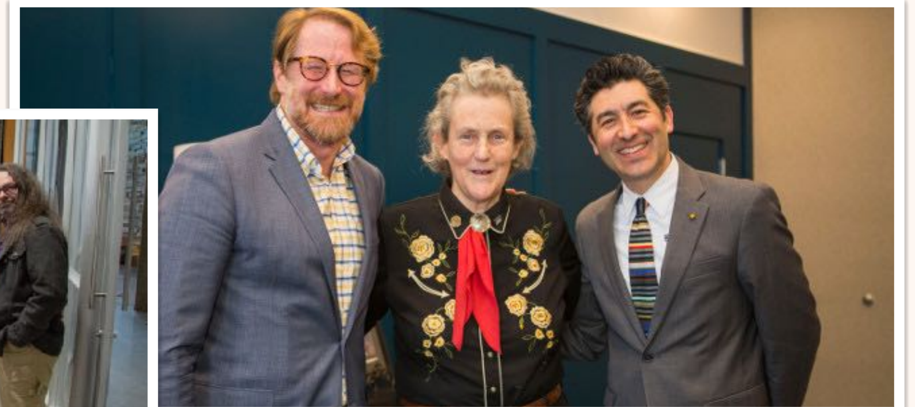
Temple Grandin Visits the Center.