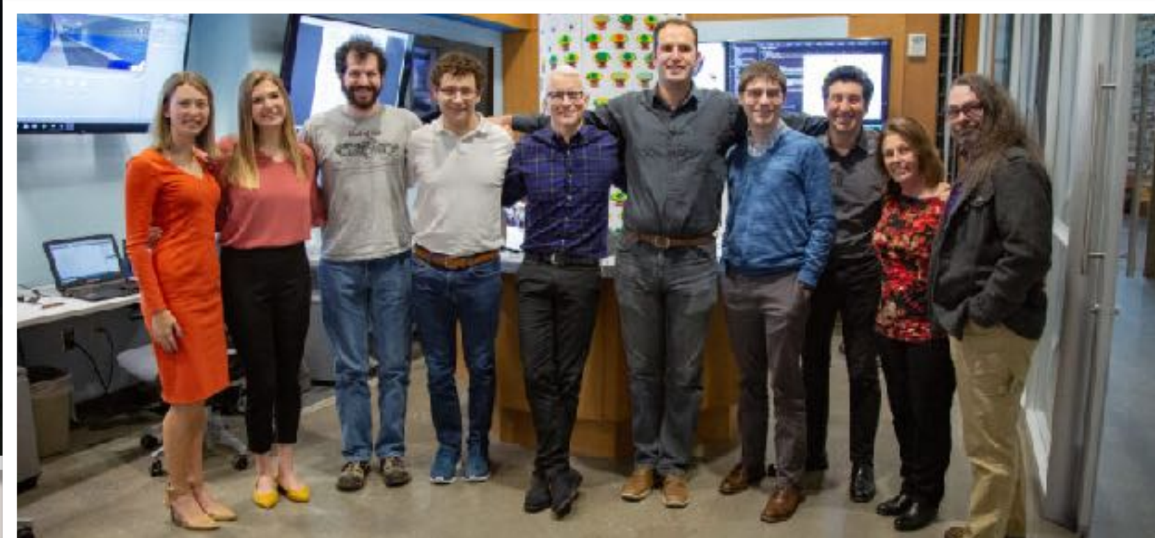
Frist Center Appear on 60 Minutes.