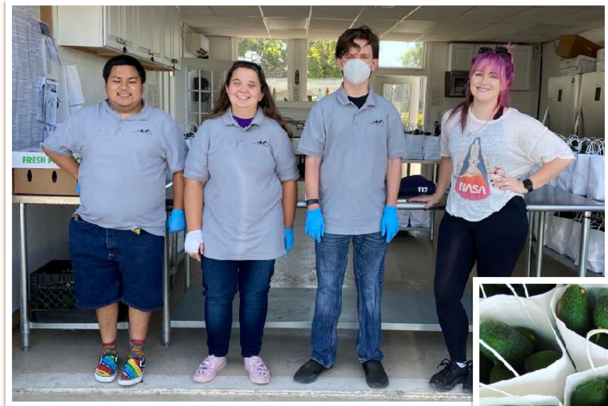
Irvine California, Summer 2022